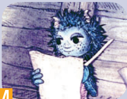
14 LITTLE DEVIL FIDIBUS