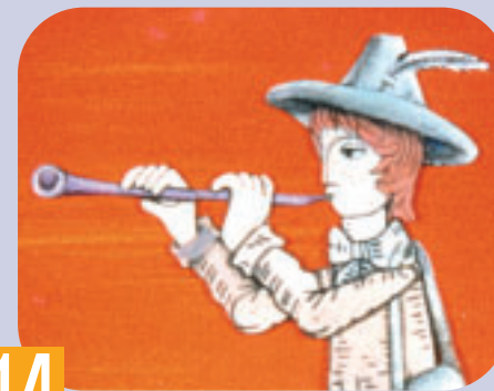
14 THE FAIRY-TALE ABOUT JOHNNY AND MARY