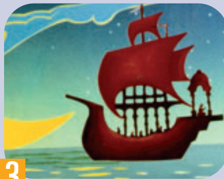
13 TALES OF A THOUSAND AND ONE NIGHTS