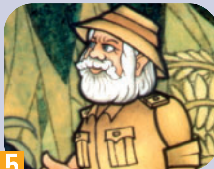
15 THE ADVENTURES OF THE HUNTER HORATIO