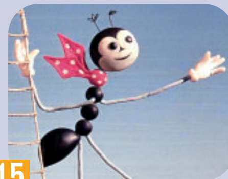
15 HOW FERDA SUCCEEDED IN THE WORLD